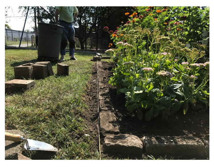
Keep it straight!